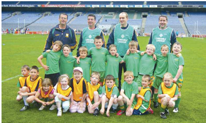
Park Ratheniska U8s and mentors on their visit to Croke Park in 2009 www.parkratheniskagaa.com