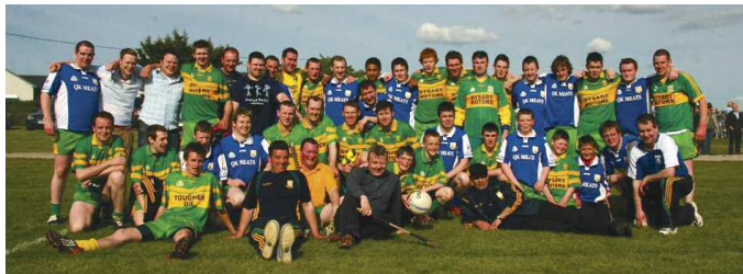
La na gClub - 2009